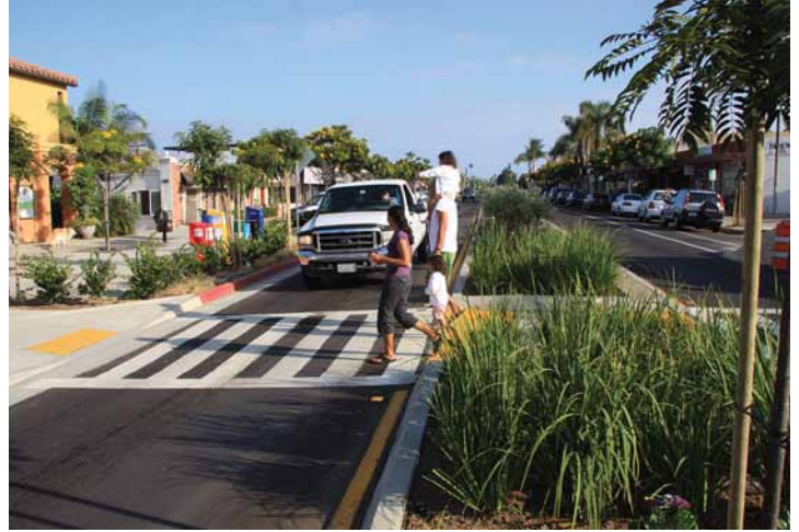
This roadway approaching a roundabout in San Diego, Calif., reduces the distance people must cross.

For modern traffic roundabouts to be effective, it's important they're done right: