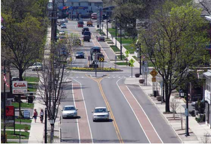
In Hamburg, N.Y., a series of roundabouts on Route 62 helps calm traffic and create a sense of place.