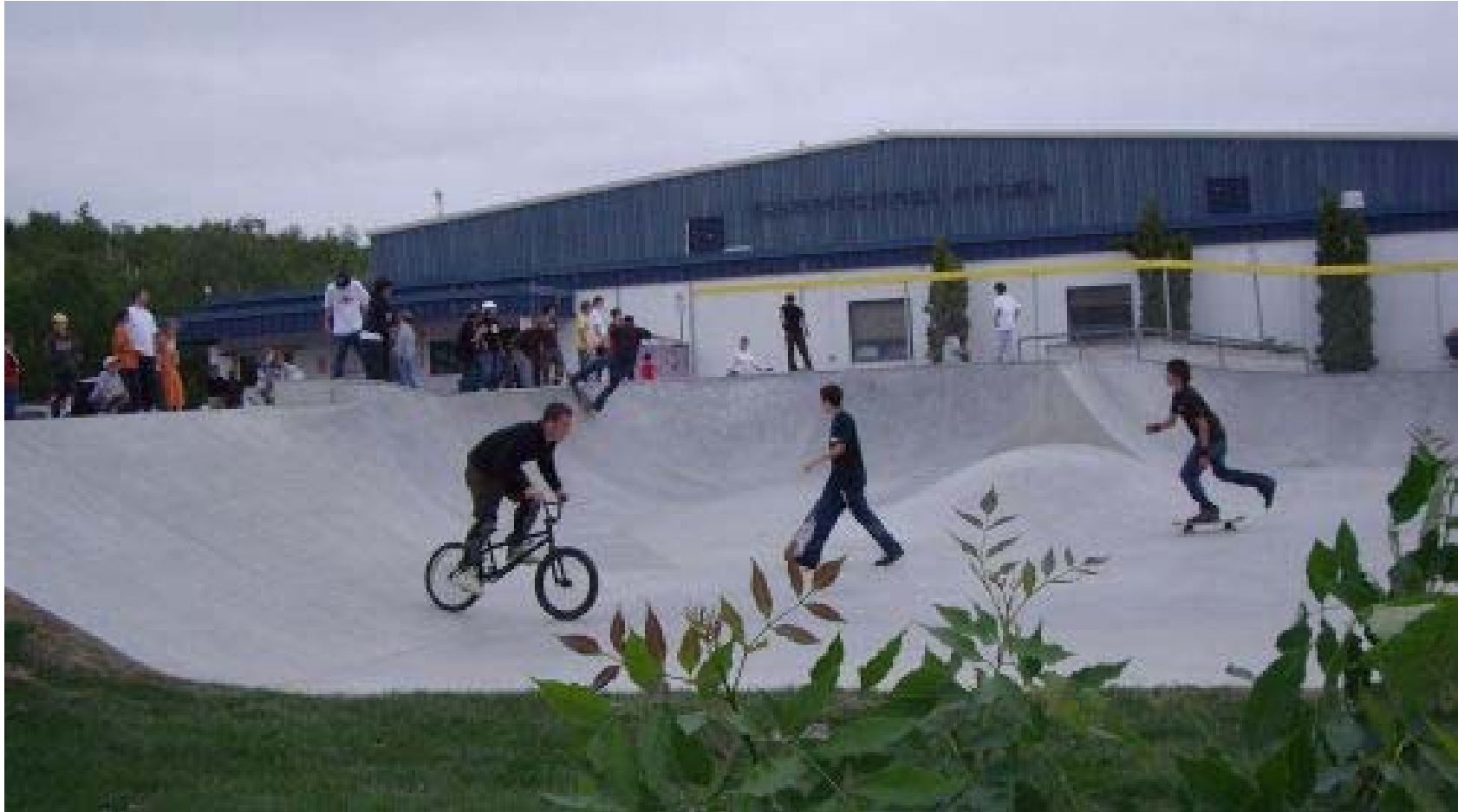
Skateboard Park – Use of former Playground (Hockey) Building ???